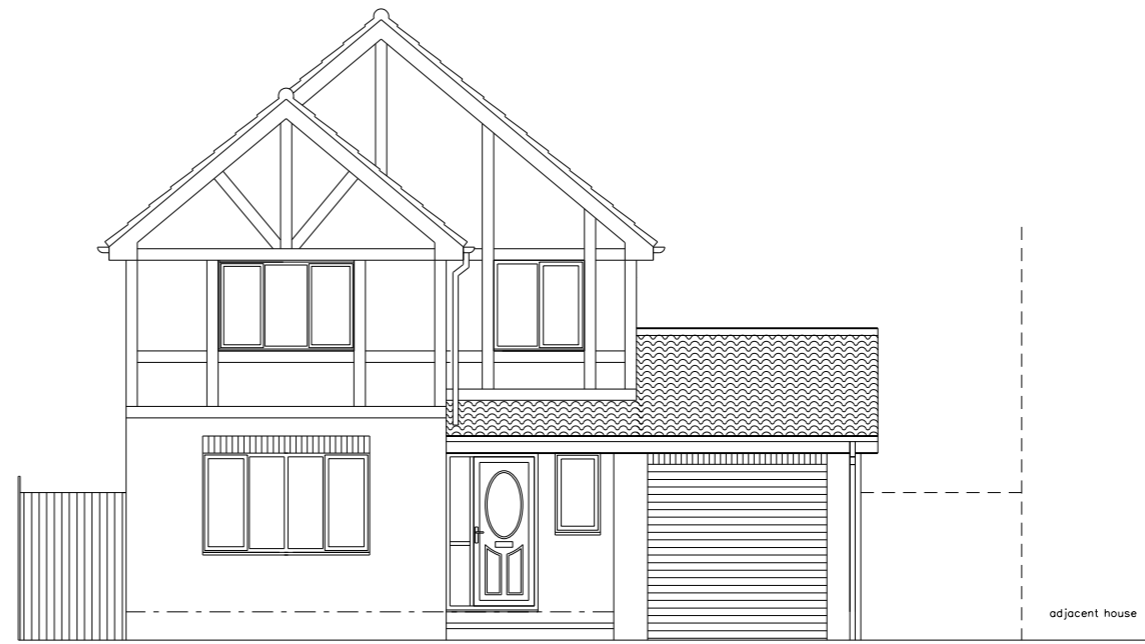
EXISTING SOUTH-EAST ELEVATION