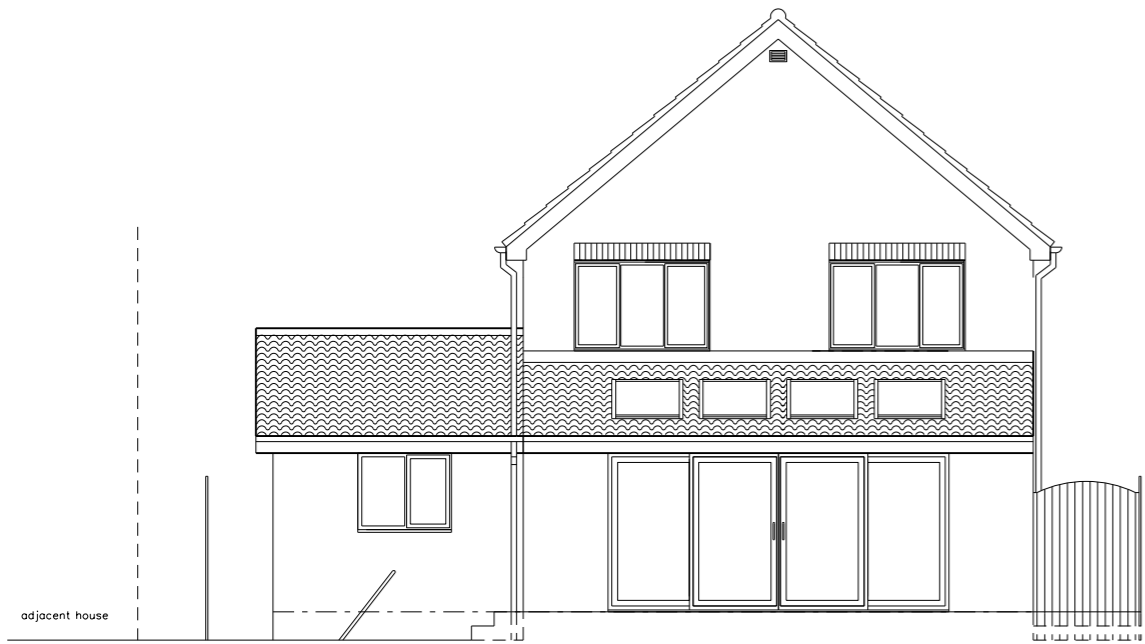
EXISTING NORTH-WEST ELEVATION